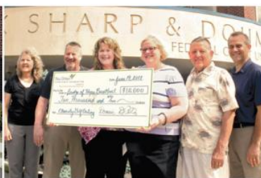
2017 Check Presentations